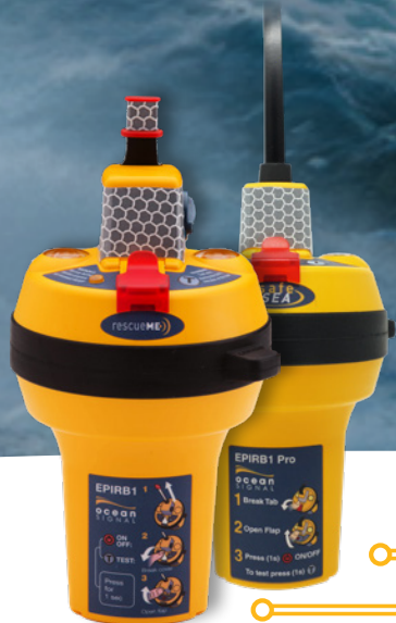
— EPIRB1 Pro — EPIRB1