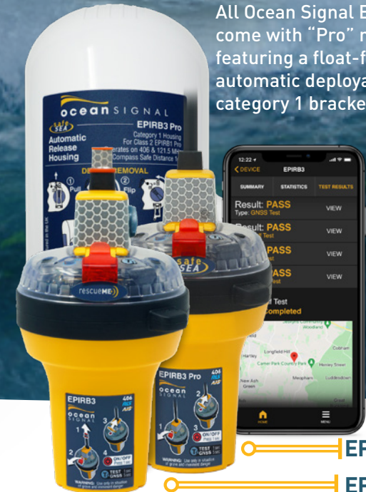
— EPIRB3 Pro — EPIRB3

These devices have not yet been authorized as required by the Rules of the FCC or Cospas-Sarsat and does not comply with the requirements of RED (Radio Equipment Directive). These devices have not, and may not be offered for sale or lease, or sold or leased until such authorization is obtained.