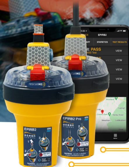
— EPIRB2 Pro — EPIRB2